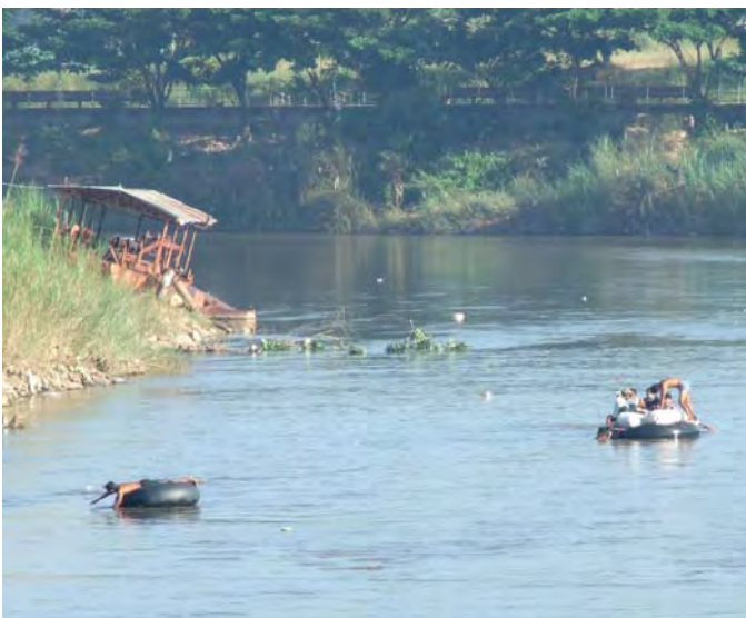
Fleeing for their lives across the fast flowing and perilous Moei River. A dangerous journey, driven by desperation to escape oppression.

Journalists have turned their attention away from Burma and, as a consequence, the demonstrations and subsequent crackdown appear to have been forgotten by the rest of the world. We should never close our eyes to the abuse of human rights,