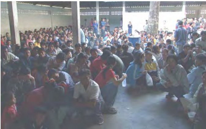
Around 300 refugees a day are deported back to Burma. This is the crammed Immigration Detention Centre in Mae Sot where it is hot, the wait is long and the people are frightened.

For the past two years the Thai government has not granted refugee status to these Burmese entering Thailand. The government fears that if they do they will be inundated with hundreds of thousands of Burmese creating a massive strain on the Thai economy and its public services. Therefore these Burmese who enter Thailand now have no status at all, they cannot get jobs or access to health care and every day run the risk of arrest and deportation. I can understand the predicament the Thai government finds itself in, but ultimately it is the Burmese who suffer, and desperately need our help.