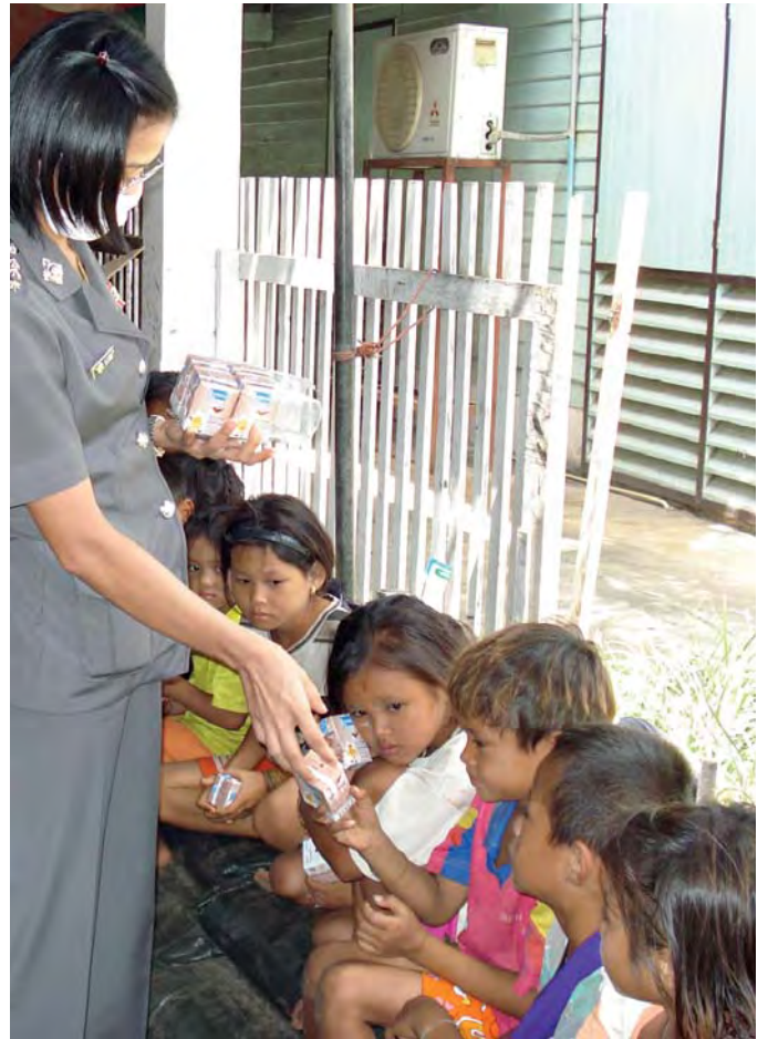
Just think what it must be like for the children at the Immigration Detention Centre. Here an immigration official, wearing a face mask, gives them soya milk, paid for by IRT.

Every day the Thai authorities arrest up to three hundred Burmese in the Mae Sot area. They are kept overnight in overcrowded cells at the Police Station. The following morning they are taken to the Immigration Detention Centre where they are processed, locked up again and then eventually deported. Some of those deported are picked up by