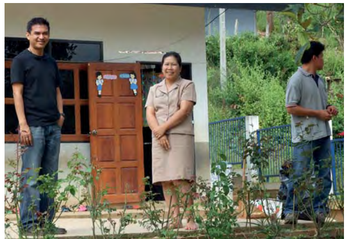
Project workers, who work incredibly hard, with the headmistress of one of the schools for refugee children. It is so important that the children continue to be educated if they are to have any hope in life.

There are only two staff members who cover a very large geographical area. I travelled with them through the mountains visiting many of the small projects they are responsible for. They spend the evenings in small guest houses and at the weekend return to the main town in the area to be with their families. I was particularly impressed with their dedication and wonderful working relationship they have with the people they are helping. It is incredible how they are able to manage so many small projects spread over such a huge region so effectively.