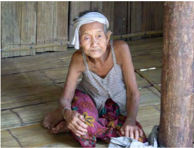
An elderly lady, alone and grieving. How grateful she is for the food IRT supplies to her and many others like her.

While we cannot stop the families being deported we will continue to do all in our power to ensure they are properly cared for while being held.