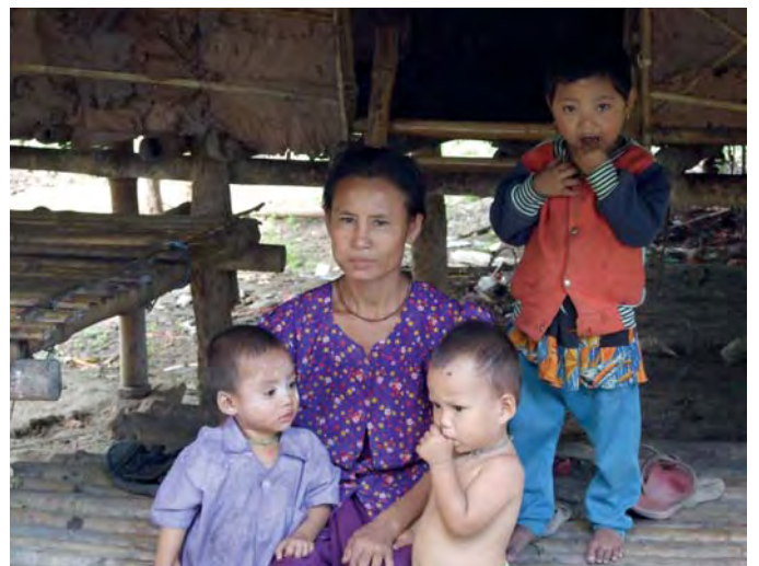
A mother and her children newly arrived in Thailand, their lives turned upside down, but safe at least.

I found it deeply upsetting to see so many young children being imprisoned before being deported back to Burma. I was given permission to visit the children in prison and was close to tears seeing them just sitting in rows, no fun or laughter, just terrified of what would happen to them.