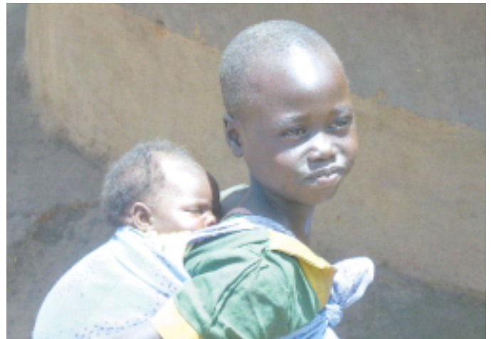
Life is already such a struggle for this orphaned girl and her baby brother. At least with an education she would have a better chance.

We already work on long-term projects that help some of the most underprivileged children in Gulu District of Uganda and Wau in Southern Sudan. These new projects will focus on helping orphans living in these areas to receive a primary education and naturally complements our existing work there. In the recent questionnaire which we sent out with our annual newsletter and to which so many of you kindly responded, support for IRT carrying out primary education projects was overwhelming. At the same time many of you were concerned that in