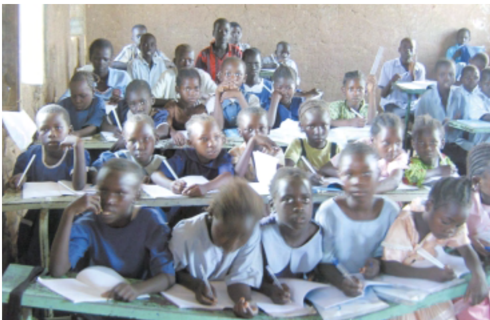
The schools that do exist are overcrowded, have few facilities and are in a terrible state of repair.

Here in Europe we value education, in the knowledge that it creates opportunity, and we know that without it our future prospects would be severely restricted. Adults and children in Africa have the same belief, but many cannot avoid the reality of more pressing every day concerns such as where the next meal is coming from.