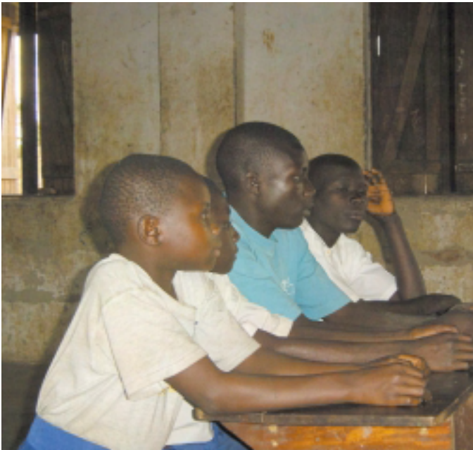
Keen to learn, but no books or writing materials.

needing to be sorted out. However, what really suffered throughout the war was the primary education system, which is now in a state of virtual collapse. A whole generation of children has missed out and the sooner the education system can be re-built the better.