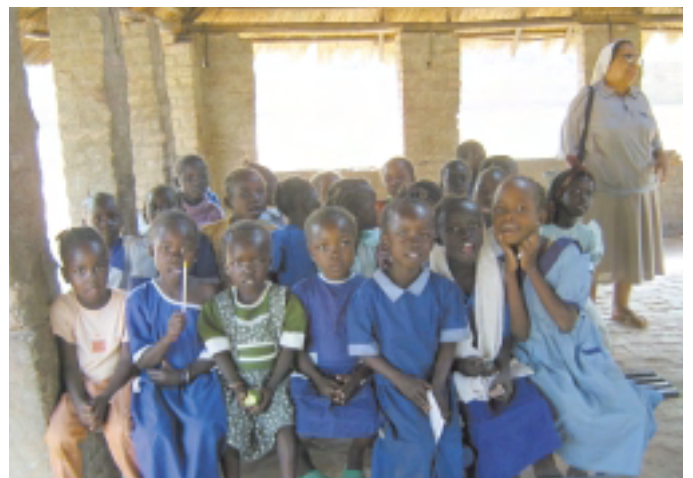
These are some of the lucky children in Wau, who go to the school run by the Comboni Sisters. With your generosity we could help many more.