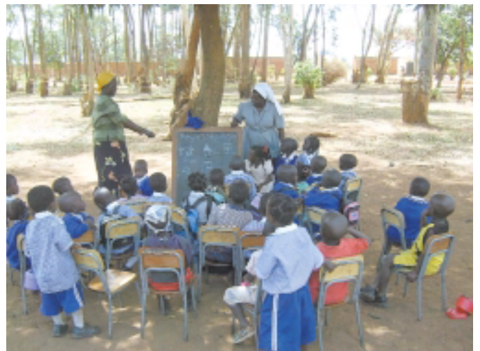
It used to be a treat at my school to have lessons outside in the summer, but these children have no option, come rain or shine.

Based on the results of this research we have developed a plan of action to help six of the poorest schools in the area. We would like to help more schools but first we need to ensure that our resources are not spread too thinly. As with nearly all the primary schools in the north of Uganda the six schools are state run. While the government does its best to help pay the salaries of the teachers it simply does not have the resources to develop the infrastructure of the schools. Therefore with the help and support of the local communities