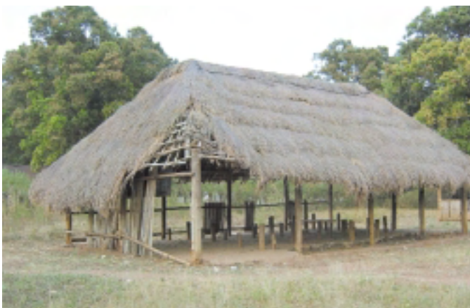
Years of war have destroyed so much, including this classroom.

For some years IRT has supported projects in Uganda to help the internally displaced people in the north of the country. While most parts of the country have had peace and prospered over the past decade, Gulu and Amuru Districts have suffered terribly through rebel activities and atrocities against the people there. Those living in the rural areas were forced to migrate and live in makeshift camps around the larger towns of the north where they could be better protected by the Ugandan army. However, with the government and rebels holding peace talks for the past year and many of the rebels giving up their guns, things are returning to normal. People are moving back to their former homes in huge numbers and are starting to re-build their lives. Unfortunately the local school buildings they are finding on their return have fallen into ruin.