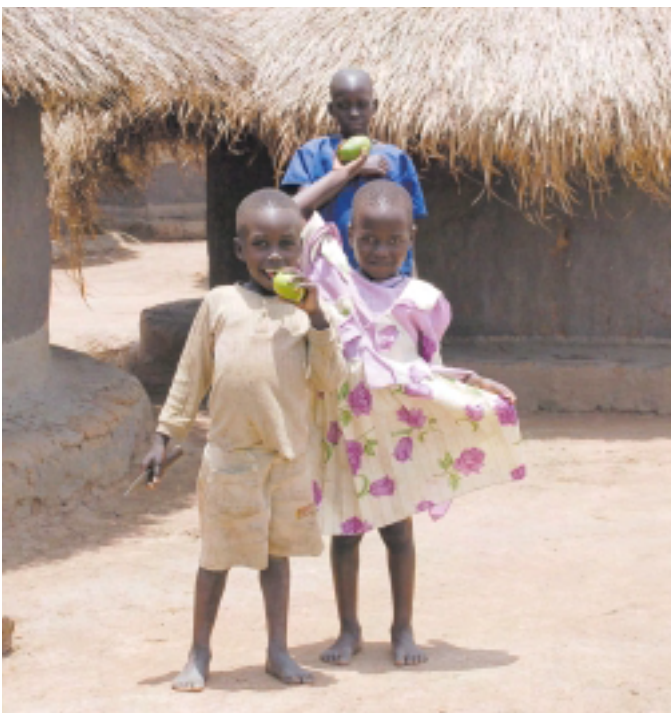
These orphans in Gulu would love to go to school.

Although primary education in Uganda is supposed to be free, in reality fees still need to be paid by pupils to help cover the schools' running costs and exam fees; the children also need to buy exercise books and uniforms. This is way beyond the means of orphans who have virtually no money. Therefore, we have also decided to pay for the education of 300 orphans in the six primary schools in both Gulu and Amuru Districts. Over the coming years we hope gradually to increase this number. To provide an education, uniform and school books for one orphaned child costs just £33 per year. Can you help one or more of these children?